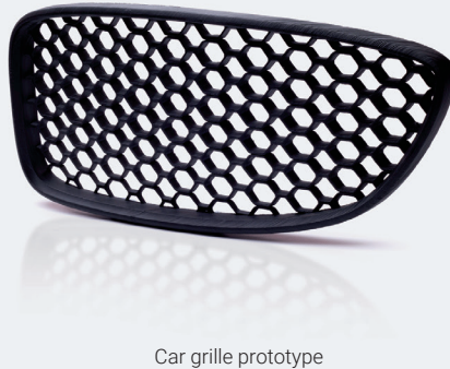
Car grille prototype