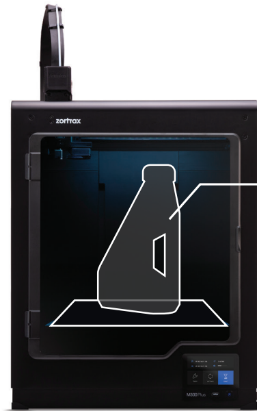
Zortrax M300 Plus 3D printer